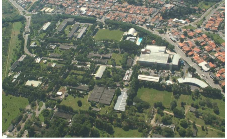
Aerial View of INPE in São José dos Campos