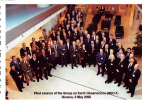
First session of the Group on Earth Observations (GEO-1) Geneva, 3 May 2005

In February 2005, the ad hoc international Group on Earth Observations (GEO) presented ministers at the third Earth Observation Summit the Global Earth Observation System of Systems (GEOSS) 10-year Implementation Plan, now endorsed by nearly 60 countries and the European Commission. The plan summarizes the steps to be taken over the next decade by a growing community of nations and intergovernmental, international and regional organizations, to put in place the GEOSS. The ministers also established the intergovernmental Group on Earth Observations (no longer "ad hoc") to take those steps necessary to implement GEOSS. Specific attention was given to the importance of consultation with intergovernmental and other sponsors of component systems of GEOSS, and to seeking the assistance of relevant international and regional organizations (e.g., CEOS) in the work of GEO.