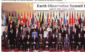
Photo of the participants of Earth Observation Summit II (Center: Japanese Prime Minister Junichiro Koizumi)

The Framework Document states at the outset that understanding the Earth system – its weather, climate, oceans,