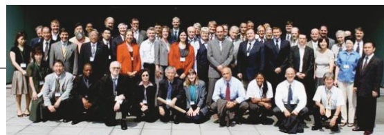
SIT-22 Participants, Tokyo, Japan