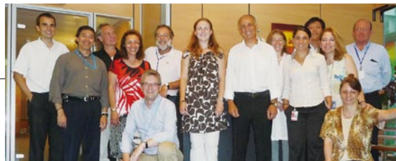
GEO Secretariat Members