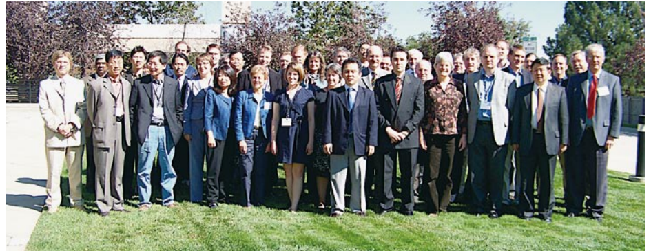
The group of WGISS-26

http://www.sapc.jaxa.jp/about/data/jaxa_and_its_capacity_building_activities.pdf