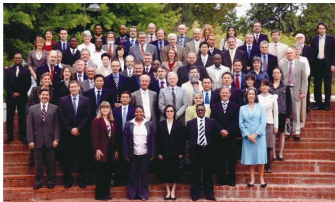
Participants of the 22nd CEOS Plenary

You may recall from the acceptance speech I made at the 21 st CEOS Plenary wherein I said: "CEOS is only as strong as the combined efforts of its members and these commitments can only be sustained through the continuing participation of members." May this statement remain one of the guiding principles in CEOS and on that note, I wish CEOS a wonderful year filled with success and reward in 2009. ■