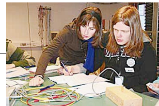
Competition winning students participating in field work at Andøya Rocket Range in February 2008

In these Newsletters I will highlight one such activity in order to demonstrate the range of training activities and the dedication of CEOS Members and Associates to this task. As a starting point, and since we are in the midst of the IPY, here is some information, kindly supplied by NAROM, the Norwegian