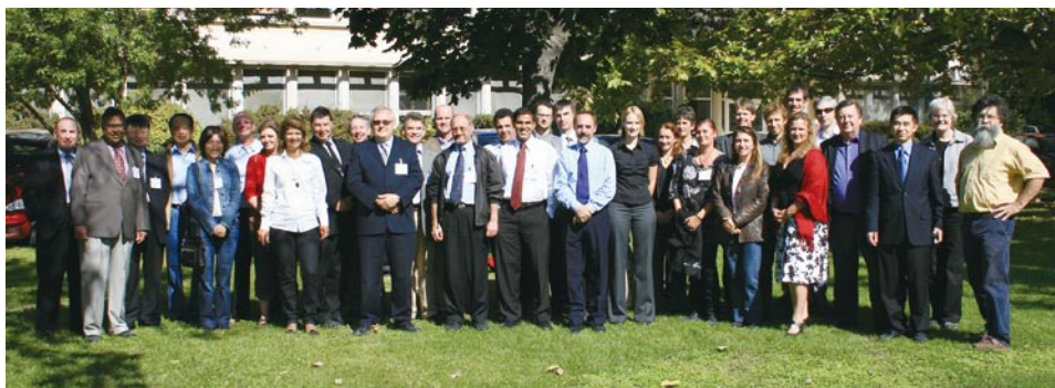
Participants to the WGCV's 29 th plenary meeting in Avignon, France

The WGCV's SAR Subgroup held its annual CEOS SAR Calibration and Validation Workshop in November. The workshop was hosted by DLR in