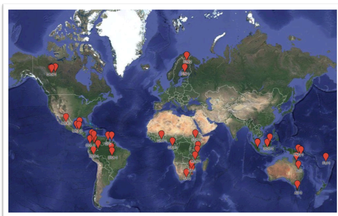
Figure 2.1 – GFOI R&D Study Sites.

Since GFOI does not possess any dedicated budget to support own research activities, the R&D programme instead aims to capitalise on already on-going research, undertaken by external experts and research groups already active in the field of REDD+ and NFMS.