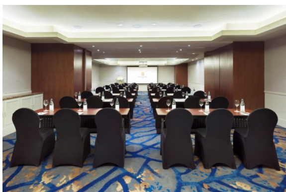
Saigon - Danang Room: Side Meeting (Oct 14, 2019)