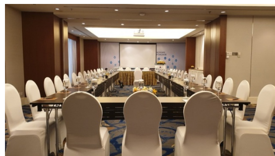
Hanoi - Haiphong Room: Side Meeting (Oct. 14);