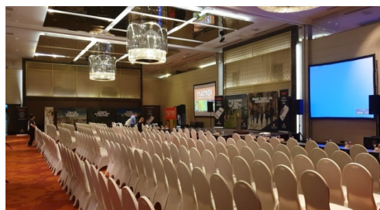
Ballroom Theatre: Plenary room (Oct 15-16, 2019)