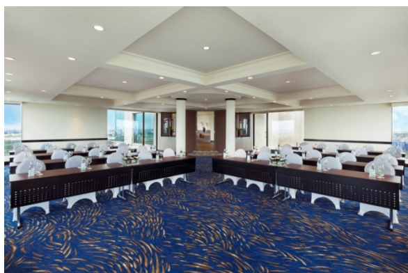
Westlake Meeting Room: Side Meeting (Oct 14, 2019)